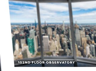
102ND FLOOR OBSERVATORY