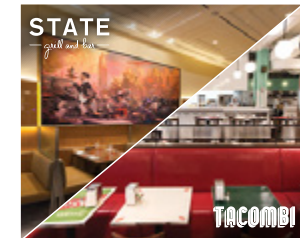
STATE grill and bar