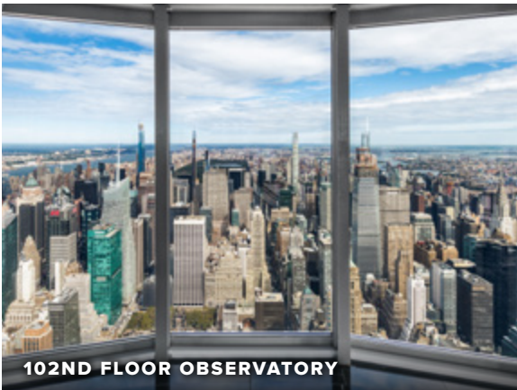
102ND FLOOR OBSERVATORY

This exhibit, created in partnership with NYC & Company, encourages visitors to create a personalized trip itinerary from the top of the Empire State Building – often their first stop in New York City. After guests answer questions about their interests and the length of their stay, they can assemble a personalized list of recommendations for attractions and sites throughout Manhattan, Brooklyn, Queens, the Bronx, and Staten Island.